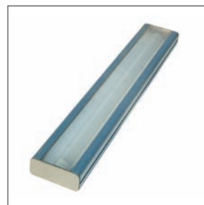
Corp fluorescent tip SYMA STAR Cod 019.010.200.001