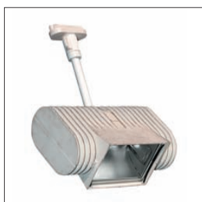
Reflector halogen SYMA STAR 300W EUR 35.00 Cod 019.010.200.006