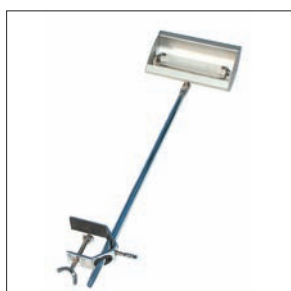
Reflector cu brat 300W EUR 35.00 Cod 019.010.200.010