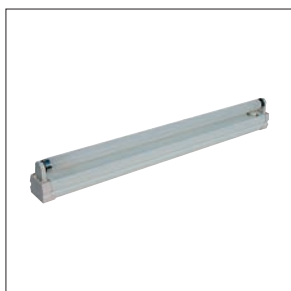
Corp fluorescent tip SS30 cu un tub D-170 - A Cod 019.010.190.001