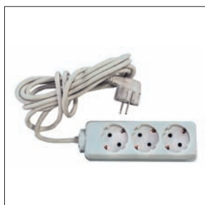
Prelungitor 230V, 10A, 3m Cod 019.010.277.000