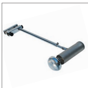
Lampa spot cu brat 100W EUR 12.00 Cod 019.010.181.000