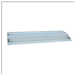
Corp fluorescent tip OCTANORM cu doua tuburi D-171 Cod 019.010.200.000