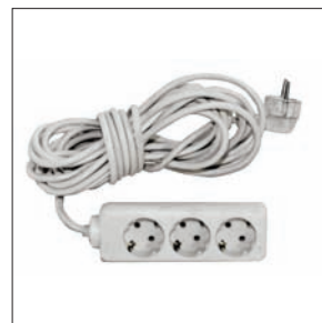
Prelungitor 230V, 10A, 5m Cod 019.010.279.000