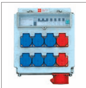
Panou Electric OCTANORM Cod 019.010.275.000