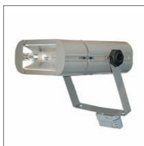
Reflector IVEN HQI 150W EUR 35.00 Cod 019.010.200.005