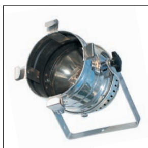
Reflector PAR64 500-1000W EUR 40.00 Cod 019.010.200.020