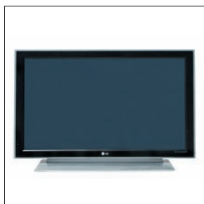
TV Plasma (diagonala ecran: 107 cm) Cod 025 010 130 040