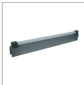
Corp fluorescent tip SS30 cu un tub D-170 Cod 019.010.190.000