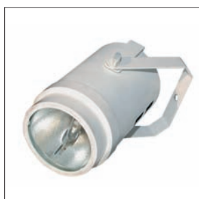
Reflector HQI 80W EUR 35.00 Cod 019.010.200.030