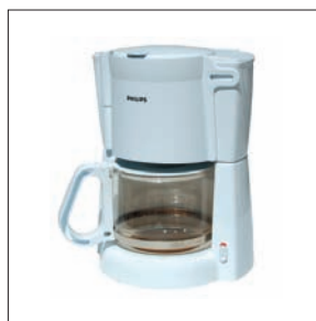
Filtru de cafea Cod 025.010.120.010