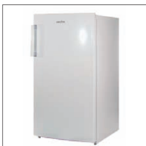
Frigider ARCTIC FB 155 Cod 025 010 020 198