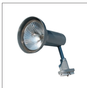
Spot halogen SY STAR 100W EUR 15.00 Cod 019.010.185.000