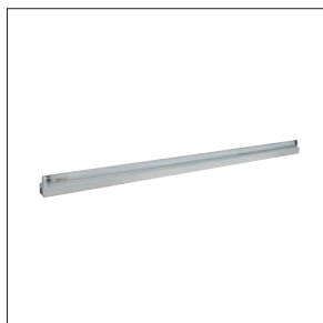
Lampa fluorescenta FIA cu instalatie electrica completa 1x40W Cod 019.010.110.000