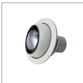
Lampa spot 100W EUR 12.00 Cod 019.010.170.000