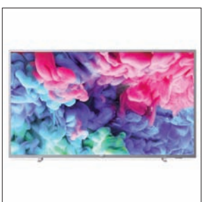
TV LED SMART 4K, UHD ultrasubtire (diagonala ecran: 126 cm) Cod 025 010 130 045