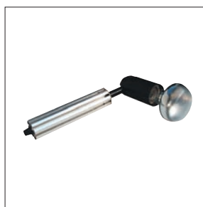
Lampa spot stut OCTANORM EUR 12.00 Cod 019.010.187.000