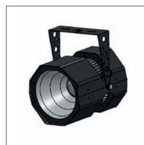
Reflector LED VIRGO EUR 40.00 40W 4350 LM 4100 K Cod 019.010.200.045