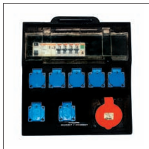
Panou Electric 380V/220V Cod 019.010.265.000