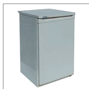
Frigider ARCTIC (180 l) Cod 025 010 070 020