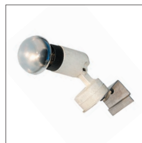
Lampa spot SS30 100W EUR 12.00 Cod 019.010.200.008