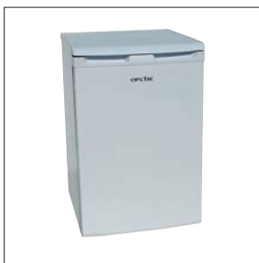
Racitor (140 l) Cod 025 010 070 010 (55 x 61 x 84 cm)