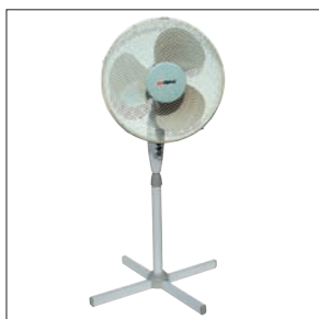
Ventilator cu picior Cod 025.010.500.020