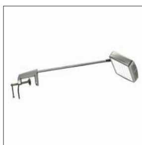
Reflector tija LED A++ EUR 35.00 16W 1100LM 4000K ARM33CM Cod 019.010.200.040