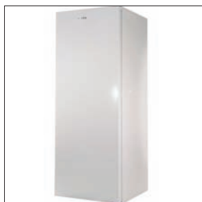
Frigider ARCTIC 255 l Cod 025 010 020 199