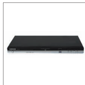
DVD Player Cod 025 010 130 030