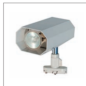
Spot halogen SY STAR 50W(A) EUR 15.00 Cod 019.010.186.000