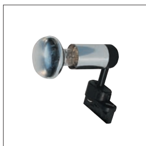
Lampa spot 100W EUR 12.00 Cod 019.010.188.000